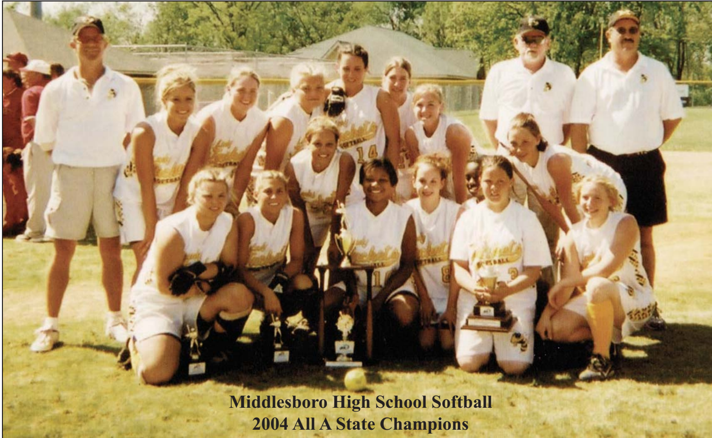
Middlesboro High School Softball 2004 All A State Champions

The 2004 team went 39-4. They threw 19 no hitters, batted .370 and fielded at 94%.